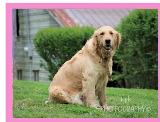
Molly (Golden Retriever)