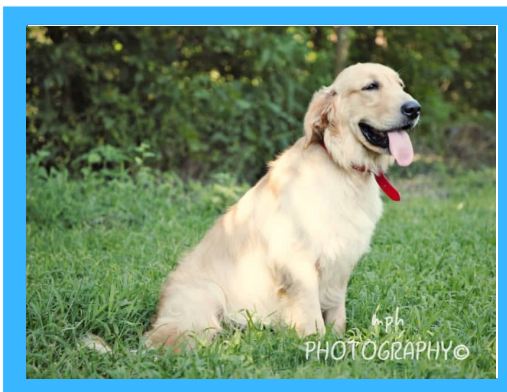
Chevy (Golden Retriever)