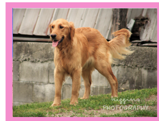
Sally (Golden Retriever)