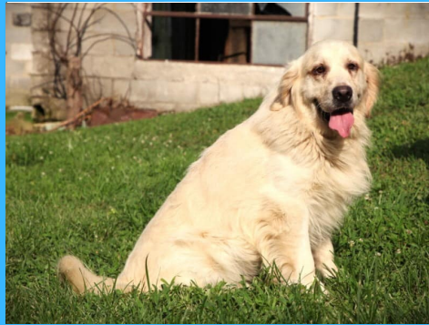
Prince (Golden Retriever)