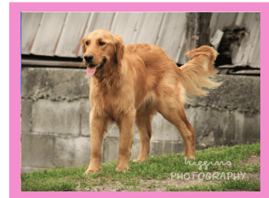
Sally (Golden Retriever)