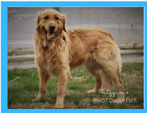
Yapper (Golden Retriever)